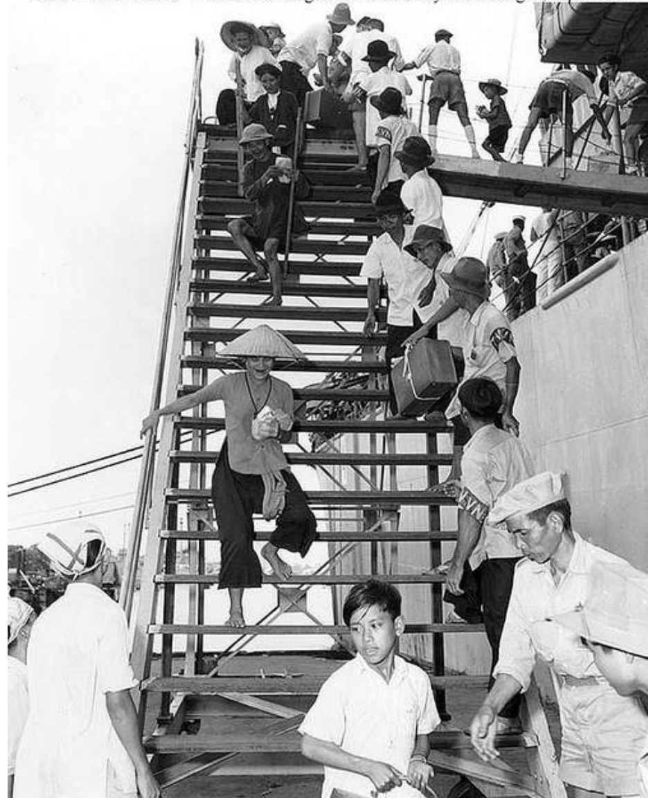
Each holding a package of rice and fish, Vietnamese refugees leave USS Bayfield (APA-33) at Saigon, Indochina, after a trip from Haiphong, September 1954