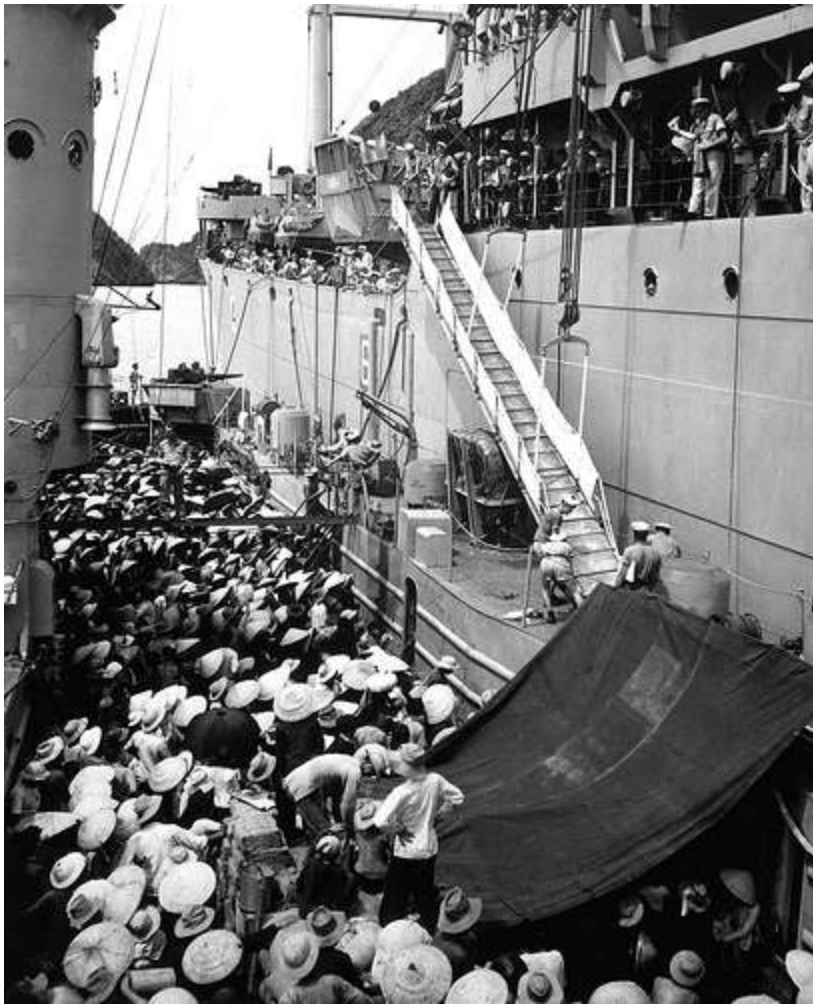
Vietnam refugees. USS Montague lowers a ladder over the side to French LSM to take refugees aboard. Haiphong, August 1954. EXACT DATE SHOT UNKNOWN.