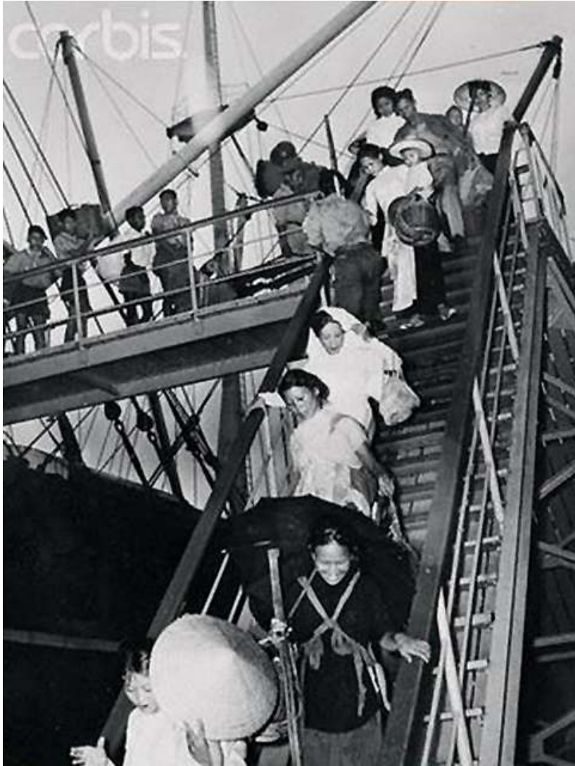
Vietnamese Travelers Goods Being Unloaded from Ship