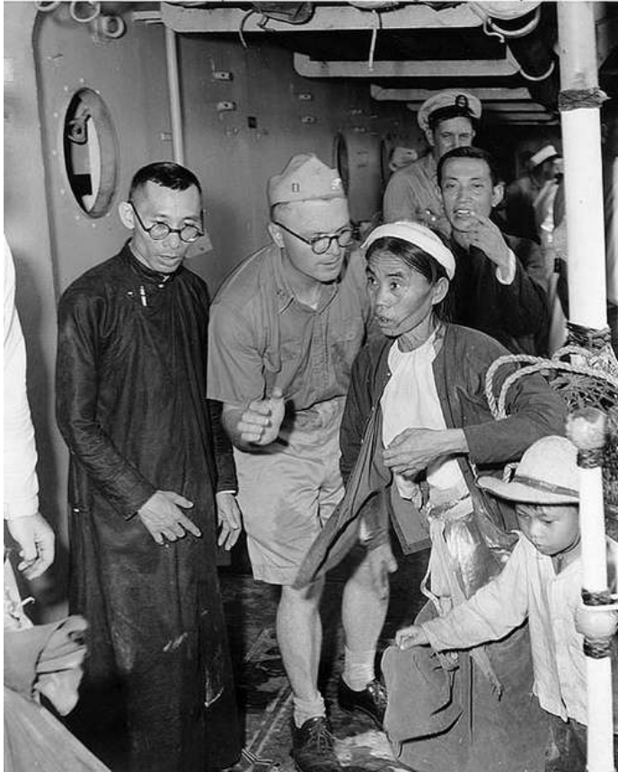
Photo # 80-G-709243 Chaplain assists Vietnamese refugees on USS Bayfield, 1954