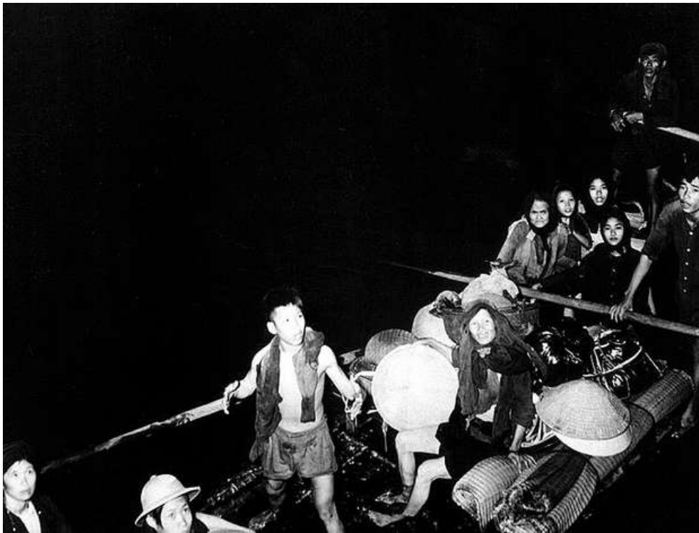
Catholics escaping communist territory in the dead of night smile as they pull alongside French landing craft that will take them to freedom. Ca. 1954.

View of Sailors with Vietnamese - November 11, 1954