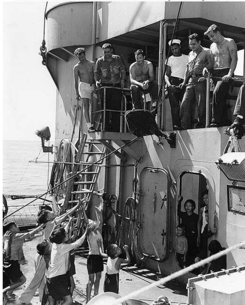
Vietnamese refugee children coax for candy, while en route from Haiphong to Saigon, Indochina, on board USS Bayfield (APA-33), circa September 1954.