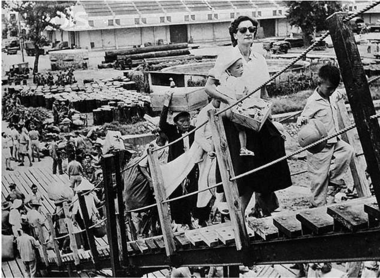
Haiphong, Indo-China --- 8/21/54-Haiphong, Indo-China: There is no sign of abatement in the steady stream of evacuees who have abandoned their homes in northern Vietnam, to flee areas that will fall under Communist domination according to the Geneva Agreement on Indo-China. Almost 2,500 refugees pour into Hanoi and Haiphong daily to beat the deadline. In this photo, a French social worker is shown helping one of the fleeing families to board a transport bound for Saigon in the south.