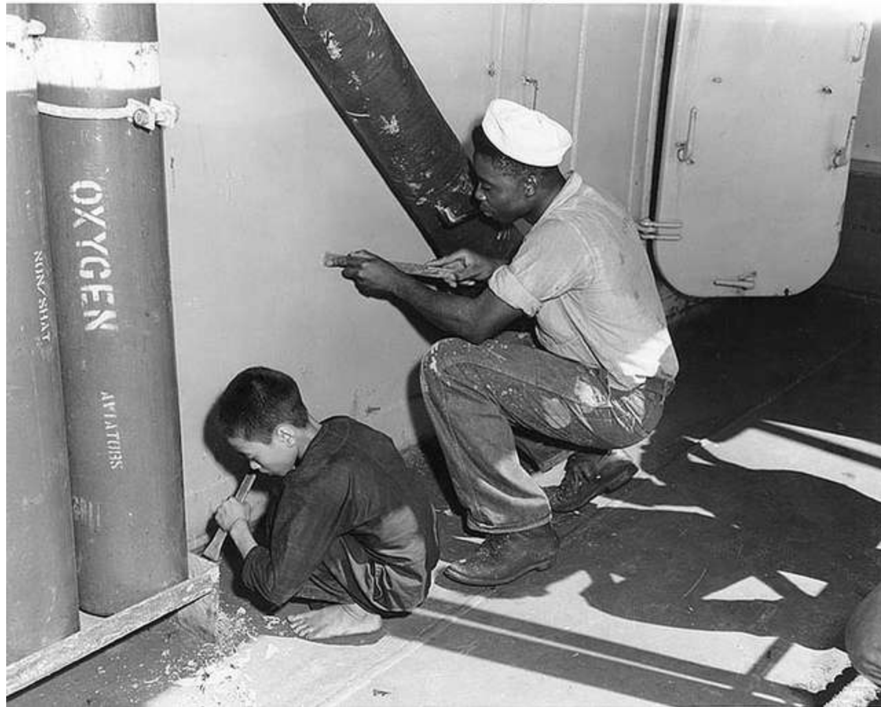
Photo # 80-G-644528 Sailor & Vietnamese boy chip paint on USS Bayfield, 1954