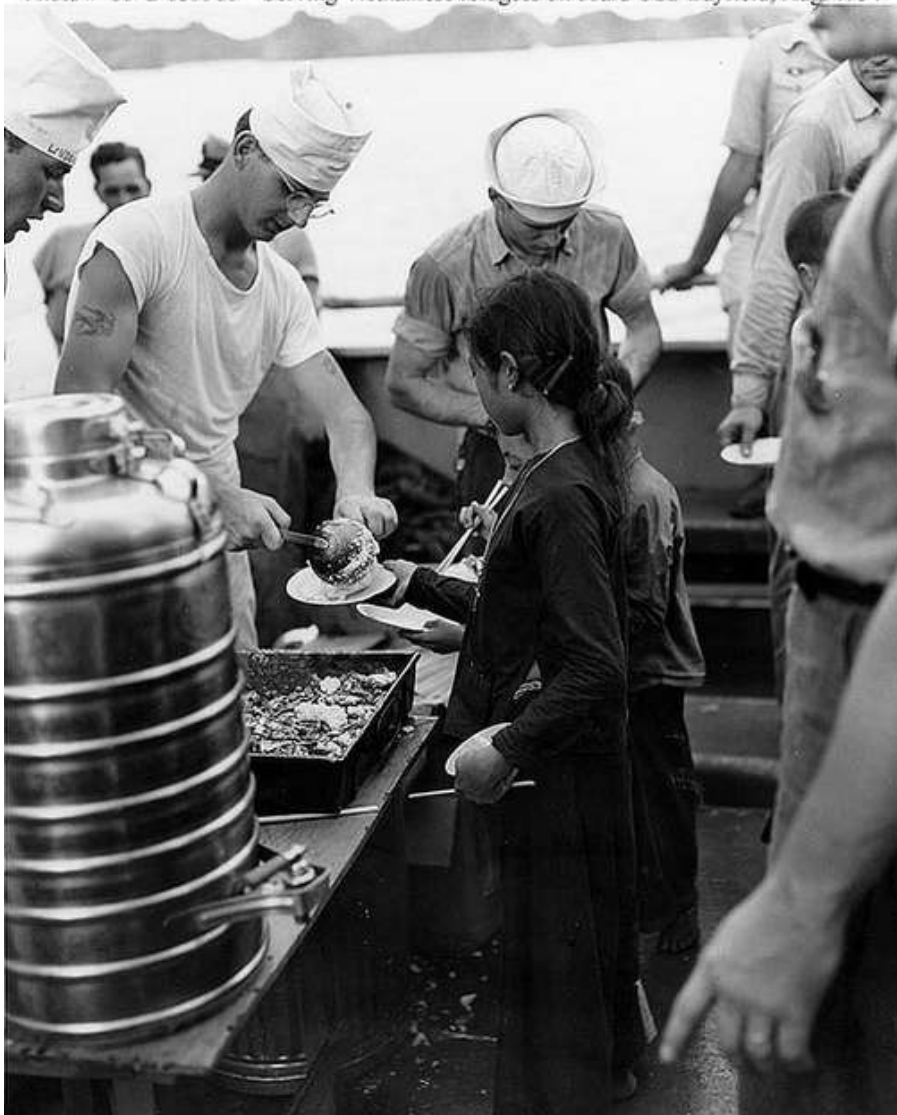
Vietnamese refugee in a topsides food service line on board USS Bayfield (APA-33), while en route from to Saigon, Indochina, August 1954.