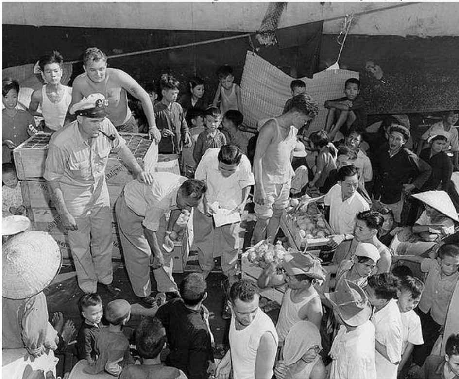
Photo # 80-G-652318 Vietnamese refugees receive food on board USS Bayfield, Sept. 1954

Vietnamese refugees receive food on board USS Bayfield (APA-33) while en route to Saigon, Indochina, from Haiphong, circa September 1954.