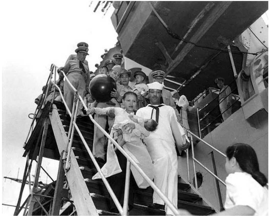
Photo # 80-G-647026 Vietnamese refugees landing from USS Estes, 1954