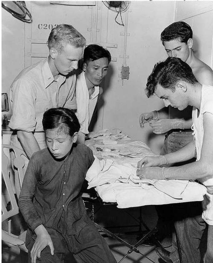
Photo # 80-G-644524 Medical treatment for Vietnamese refugee on USS Bayfield, 1954