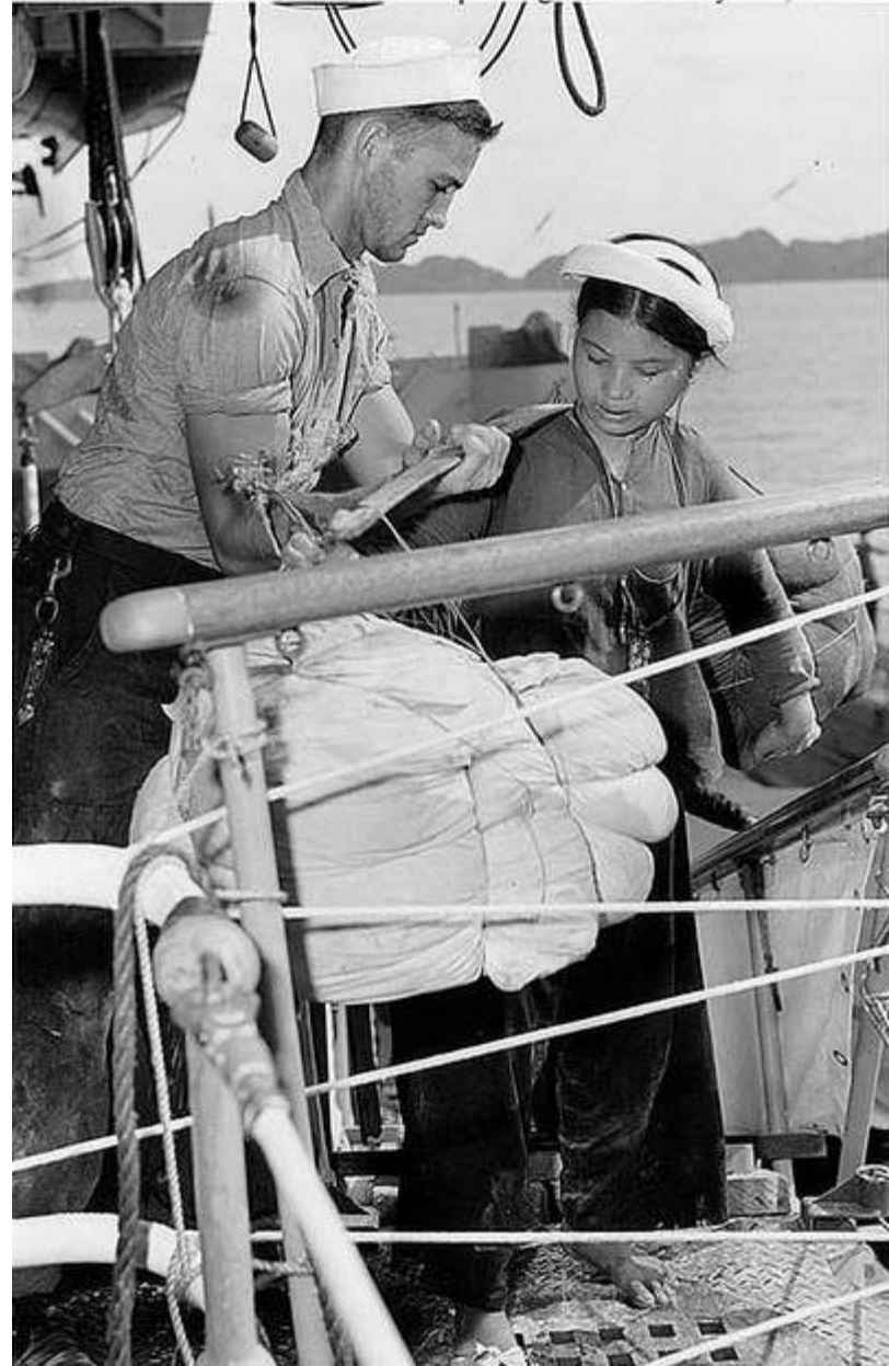
Sailor assists a heavily burdened Vietnamese refugee boarding USS Bayfield (APA-33) for passage to Saigon, Indochina, from Haiphong, 3 September 1954.