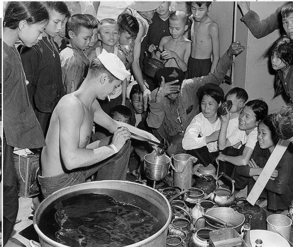
Photo # 80-G-709244 Crewman rations out water to Vietnamese refugees on USS Bayfield, 1954

A crewmen rations out water for Vietnamese refugees on board USS Bayfield (APA-33) during their journey to Saigon, Indochina, from Haiphong, circa September 1954