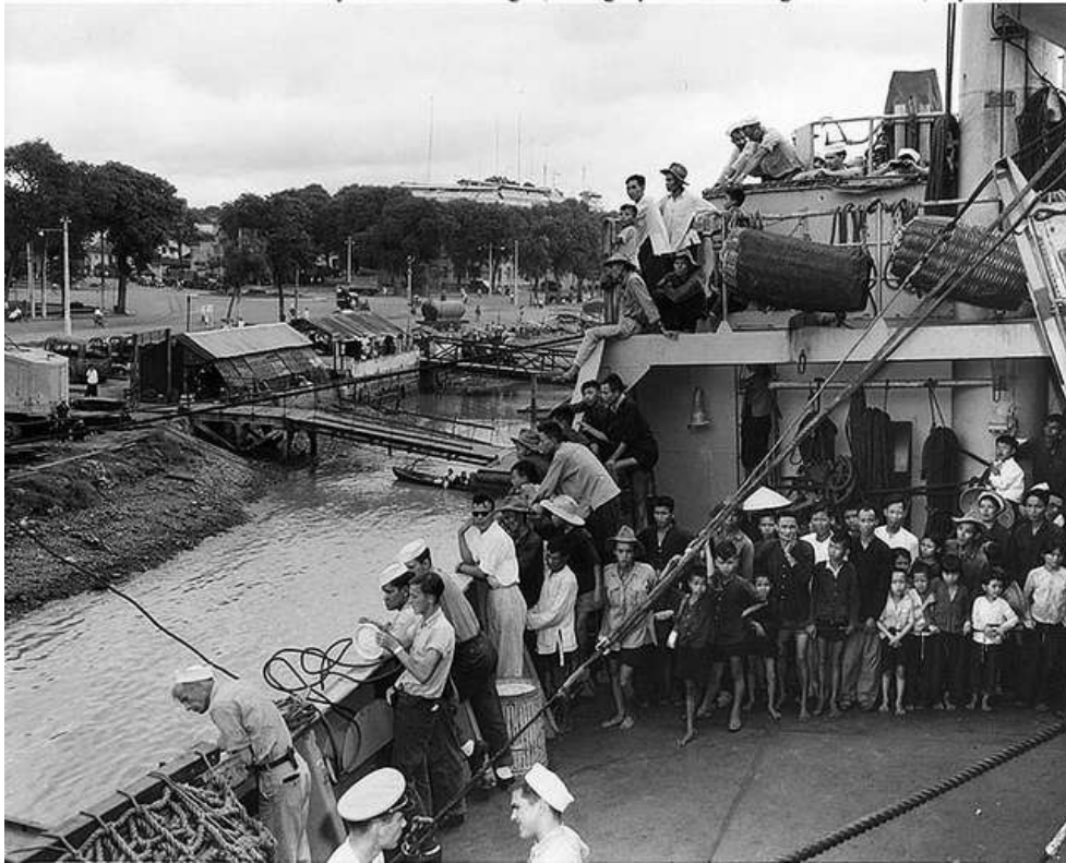
USS Bayfield (APA-33) docks at Saigon, Indochina, to offload refugees following a trip from Haiphong, September 1954.